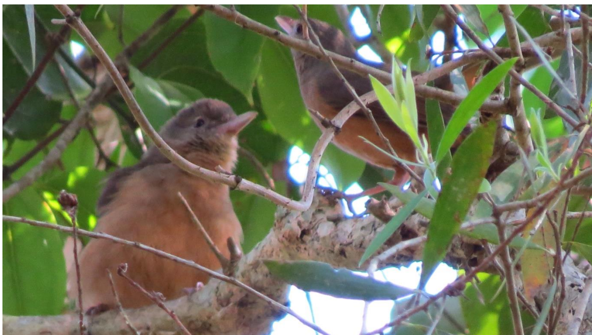
A pair of Little Shrike-thrushes serenading each other

Grey mangroves are still dropping fruit (some of which are huge), the Stilt-rooted Mangroves are coming into bud whilst also forming hypocotyls, the Orange Mangroves are at all stages from buds to mature hypocotyls, and the River Mangroves are heavily in bud, some buds just forming and some plump as though ready to burst into flower.