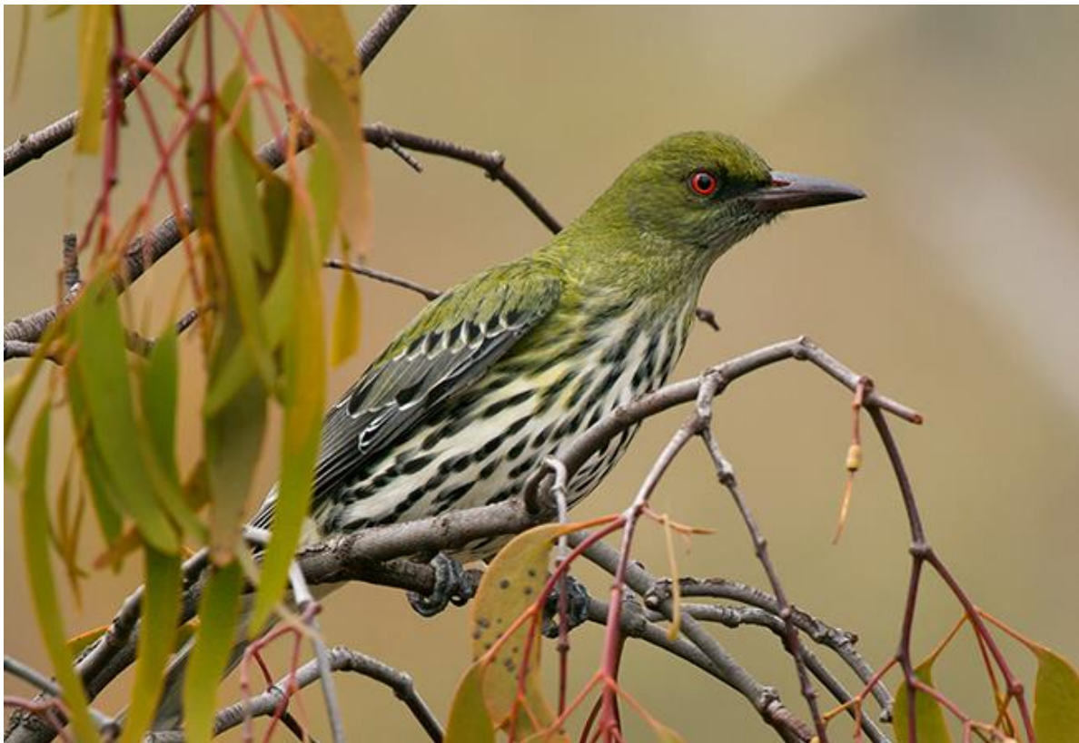
Olive-backed Oriole