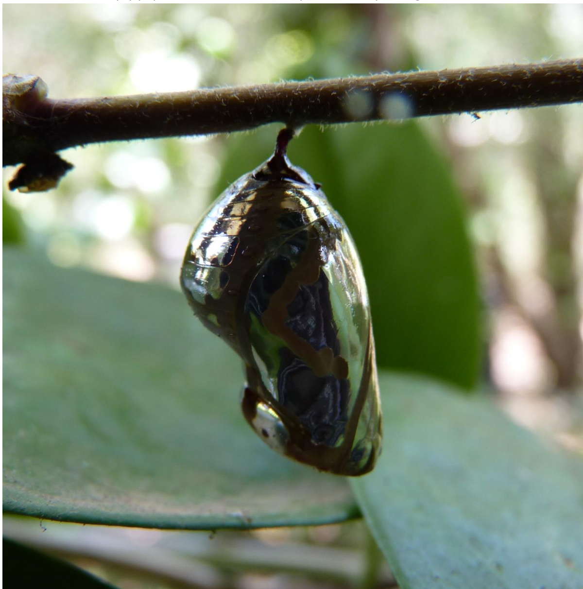
Mirror-like pupa of the Common Crow