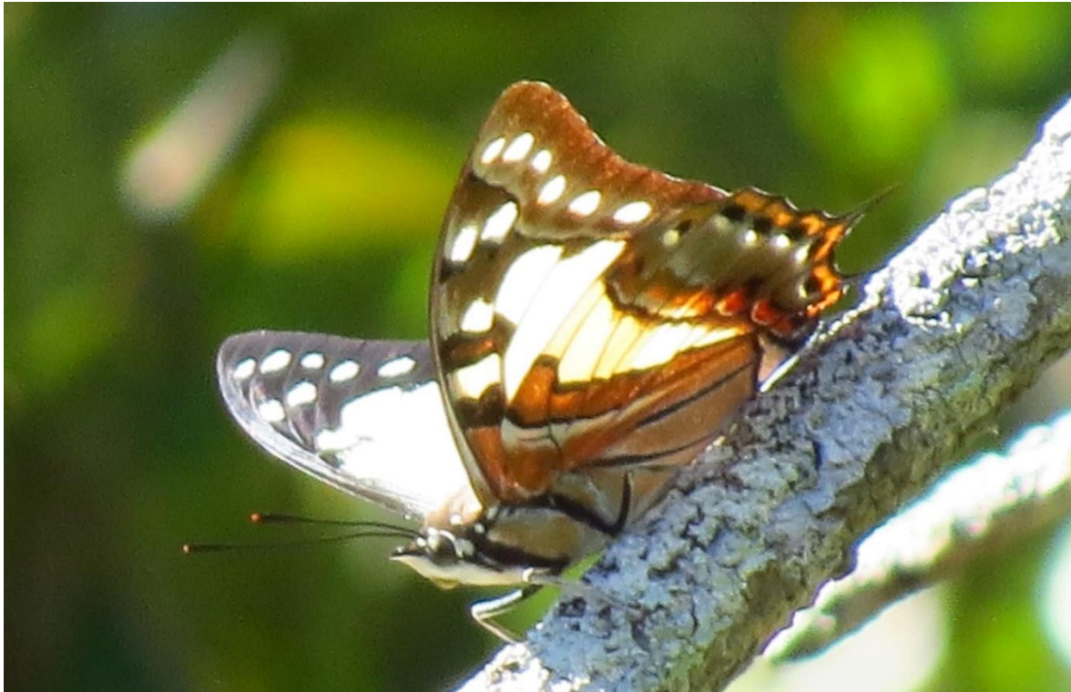
Tailed Emperor – one of our less common butterflies on the Sunshine Coast

group's outings. Unfortunately, they missed out, but George saw the female the following day. In compensation, they did have lovely views of the magnificent Tailed Emperor (butterfly) which sat warming in the early sunlight.