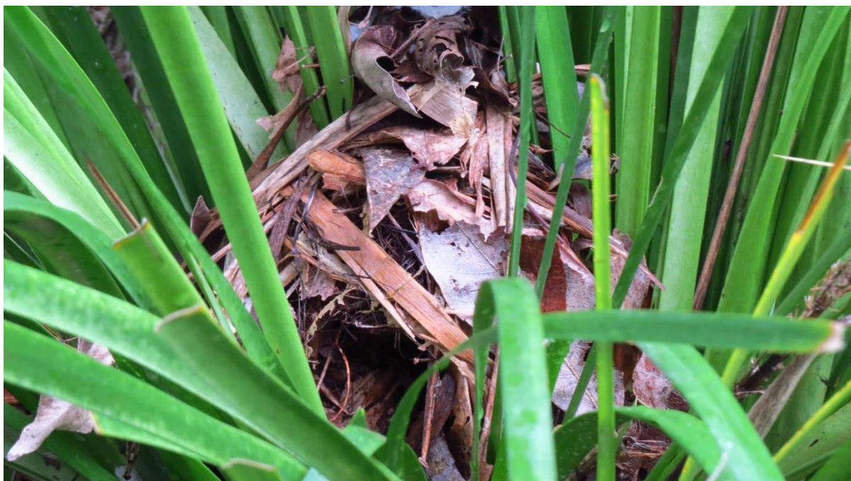
White-browed Scrubwren's nest with entrance low at the front

The unseasonal rain continued throughout June and maintained vegetation at its peak, and also seemed to keep the bird population happy and active. Some were even building nests, but none were noted actually raising young. White-browed Scrubwrens chose a quiet site in a Lomandra close to the buildings, but unfortunately, it was beside the door to our meeting room. The quiet suddenly ceased at meeting time, and turned to lots of activity.