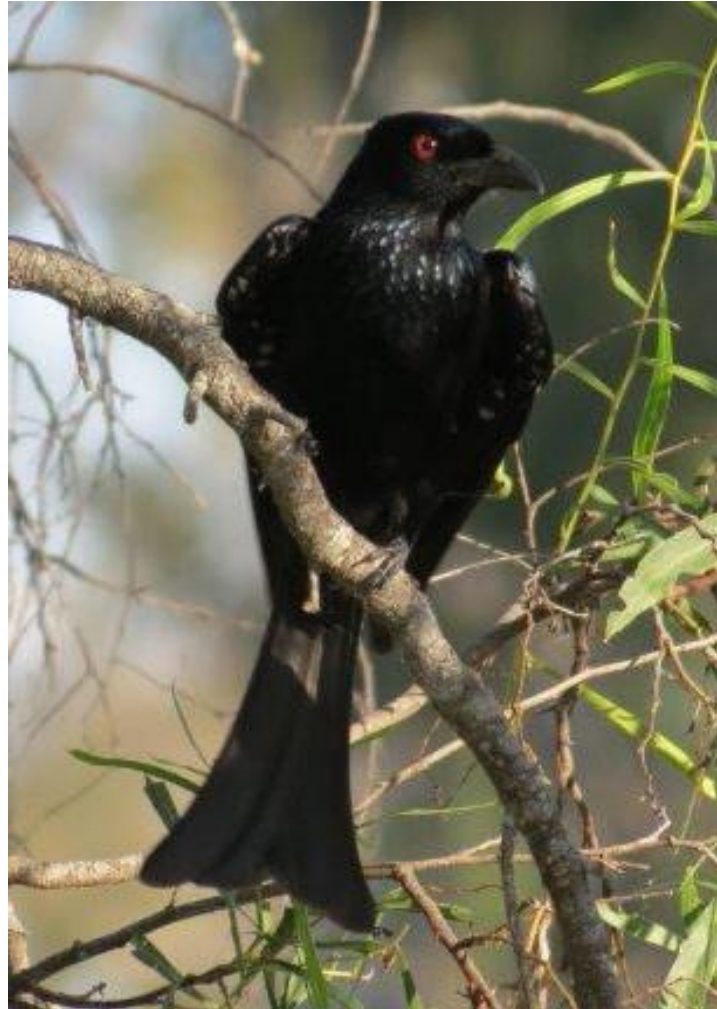
Spangled Drongo – What an amazing mimic!

As I left the forest one day, I was listening to all the cacophony and melody of so many birds. Suddenly, one loud shrill call emanated from above and every other bird shot in panic deep into the protection of undergrowth or rainforest. The call was that of the Collared Sparrowhawk, but I could not find the bird at first. Three more times the call came, each time from a different position, but always hidden by thick foliage. The other birds all remained silent. I eventually found the culprit, which then changed to its natural call. A Spangled Drongo! I have heard them mimic various birds in the past and this effort seemed perfect. It had fooled all the birds as well as me. It was up there bouncing around, chattering, highly amused with its own antics.